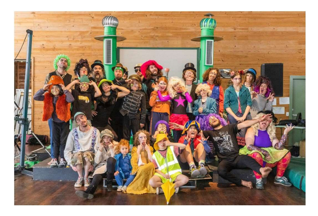
Denmark Arts - Bounce Back circus program, Photo by Nic Duncan